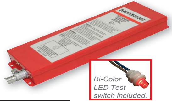
Bi-Color LED Test switch included.